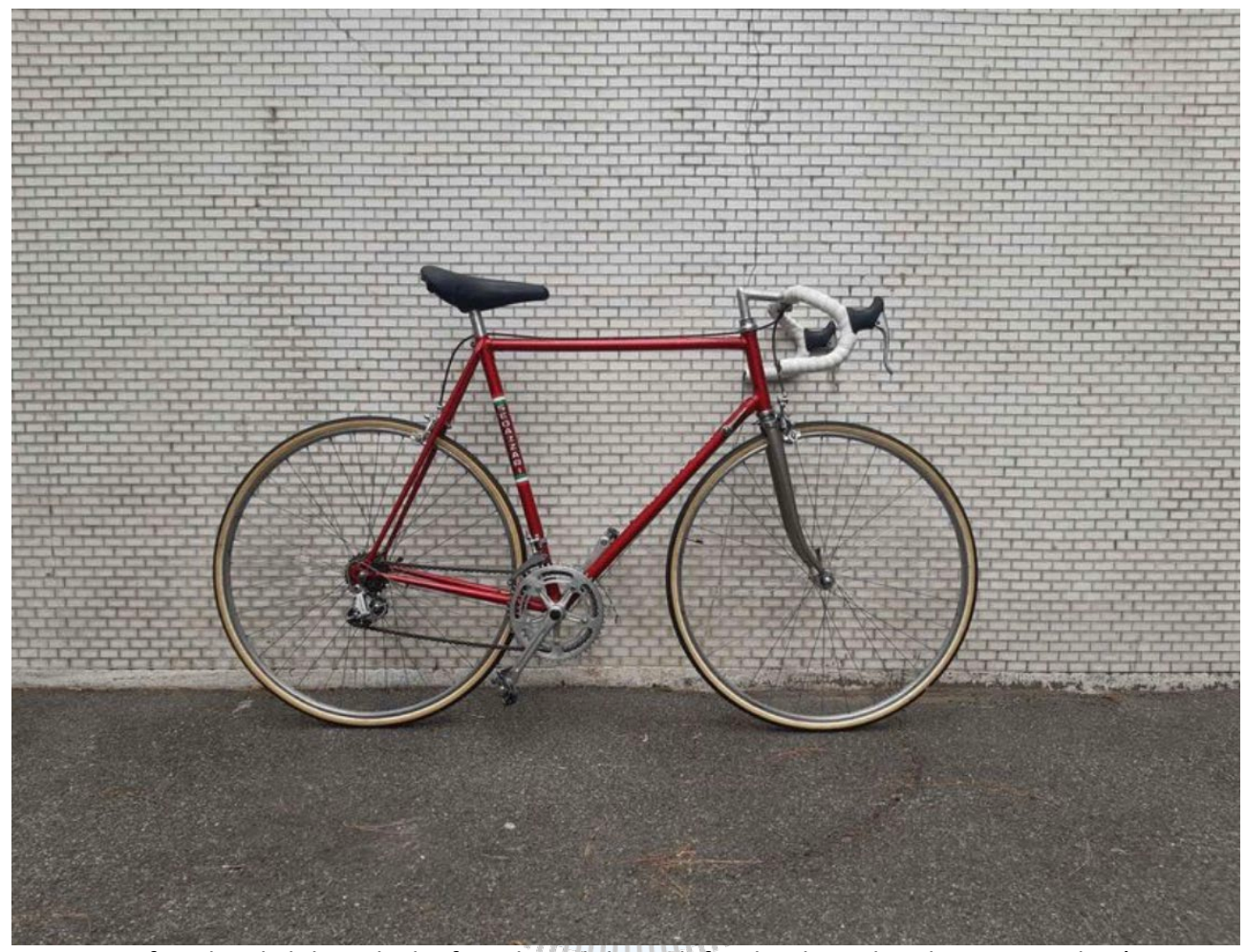
A picture of my lovely bike, which I found used through facebook marketplace - a good 80's vintage Italian racing bike.