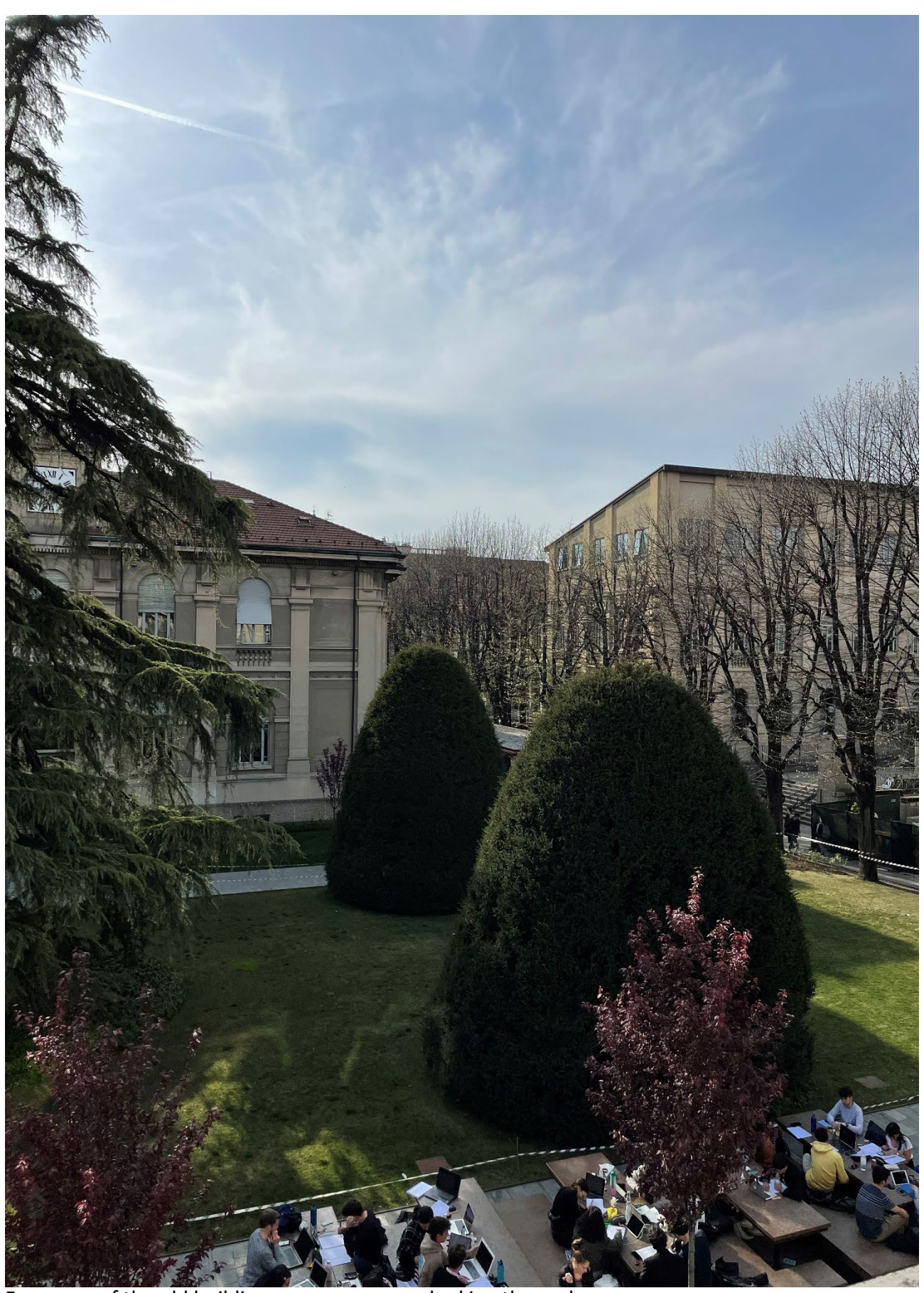
From one of the old buildings on campus overlooking the park area.