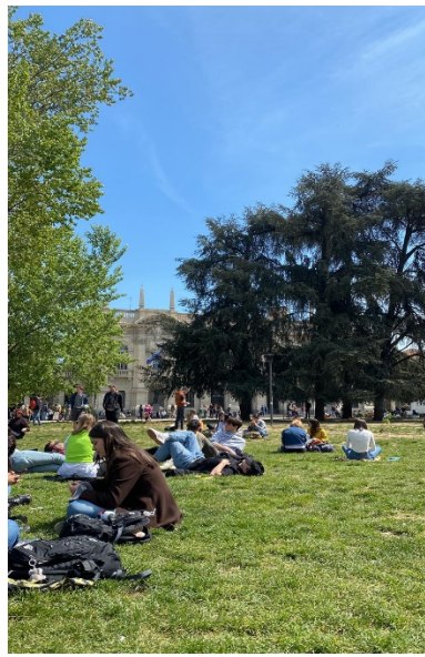
Lunch spot at Piazza Leo.