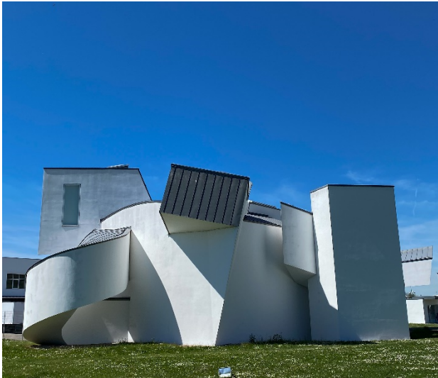
Weekend trip to VitraDesign Museum, enjoying a day filled with Frank Gehry's, Zaha Hadid's and many more iconic masterpieces.