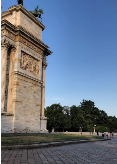
Arco della Pace – 'not a Duomo photo' of Milanese monument :)

Since Politecnico di Milano is a huge university, it also has its own gym. It is a great gym and would recommend you to have a membership there. But as with anything in Italy, you have to pass the bureaucratic process before you are allowed to go. It was worth it in the end, if you ask me. You also have a running track you can use (almost) for free.