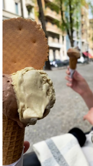
Best gelato – Artico! (Close to Leonardo Campus)