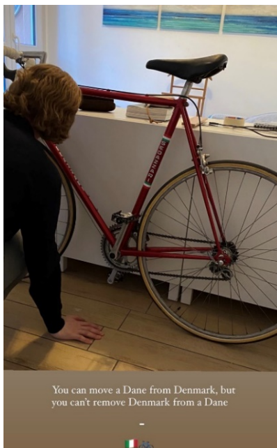
You can move a Dane from Denmark, but you can't remove Denmark from a Dane

I mentioned that it was only 8mins by bike to the university – you guessed it, I was living with a Dane. Since he bought a bike, I decided to do the same. Was it a good idea? Neither yes nor no. Traffic in Milan is one of the most hectic ones I have ever experienced. And honestly, it is not safe to ride a bike there. Italy is a country where everybody owns a car and it has yet not adapted to bicycle traffic. But once you get united with the chaos, it was fast to get anywhere and I didn't have to use public transport so I was happy. If I am not mistaken, the monthly ticket for the metro, and the bus is around 20 euros which is a really okay price – if you like to take public transportation in Italy.