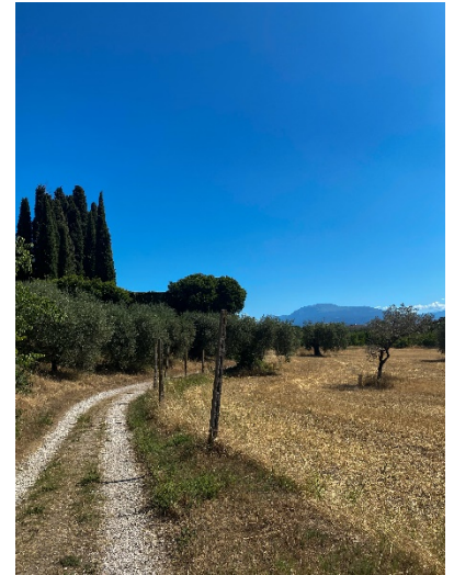
Getting lost somewhere off road in the olive gardens of Lago di Garda.