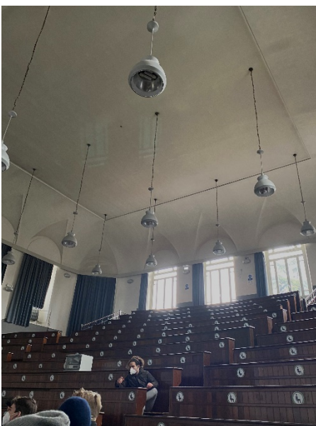
Most of the classrooms at Leonardo Campus. Big auditoriums with not a lot of space for the individuals. (Practical studio classes were not held in such auditoriums.)

Politecnico has an enormous problem regarding its facilities. I can't even tell you the number of times I came to university and could not find a single spot to sit and study. That is crazy. Some students are literally studying on the staircase (and the staircase is not as nicely designed as some in Copenhagen). Sockets ... I don't even want to start with them. One of the biggest pieces of advice I can give you is to take an extension cord with you!! Because even if you will be so lucky to find a socket, it will probably be 2 or more meters away from you. On top of that, already at the start of spring, it started to be either too hot or too cold inside the campus. It became more and more clear how the whole service department was poorly managed in both air conditioning and ventilating rooms, thus studying at the campus during late spring and summer was quite uncomfortable. Furthermore, almost nobody among the employees (excluding professors from the international line) speaks English. I know it seems like little things, but from a university which is ranked as 5th best in Europe, I expected a bit more.