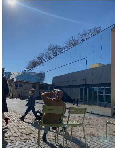
Enjoying field trip at Fondazione Prada