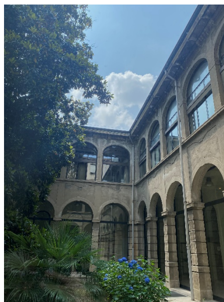
One of many beautiful parts of the campus consisting of inside gardens and astonishing architecture.