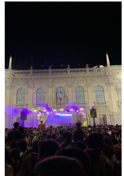
Later in the evening, Piazza Leo becomes a nr 1 go to spot for events.