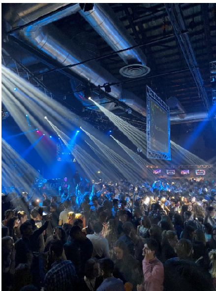
Parties in clubs organised by student community.

I enjoyed lunch breaks so much. In the beginning, I was wondering why we have almost an hour and a half for a lunch break, but later I realised, when you basically live at university from morning to evening, it is nice to have that hour and a half to enjoy the sun and recharge. The lunch spots were something to live for. There is a big meadow just in front of the campus at Piazza Leo where almost everybody eats together. I met people I will remember for my lifetime. Amazing people from all over the world and you will hardly ever feel alone.