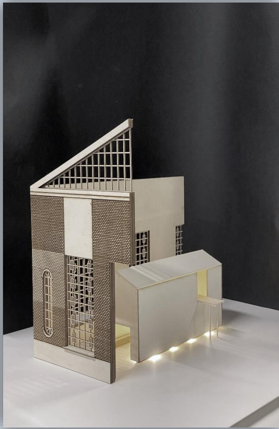
Final model for studio exam

4. What kind of expenses did you have in general?