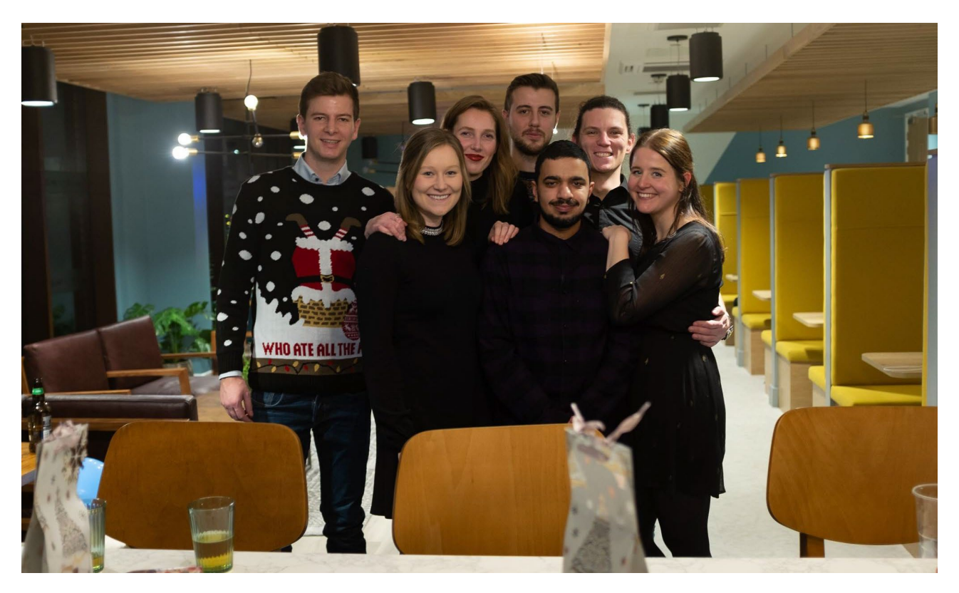
Christmas / Goodbye party