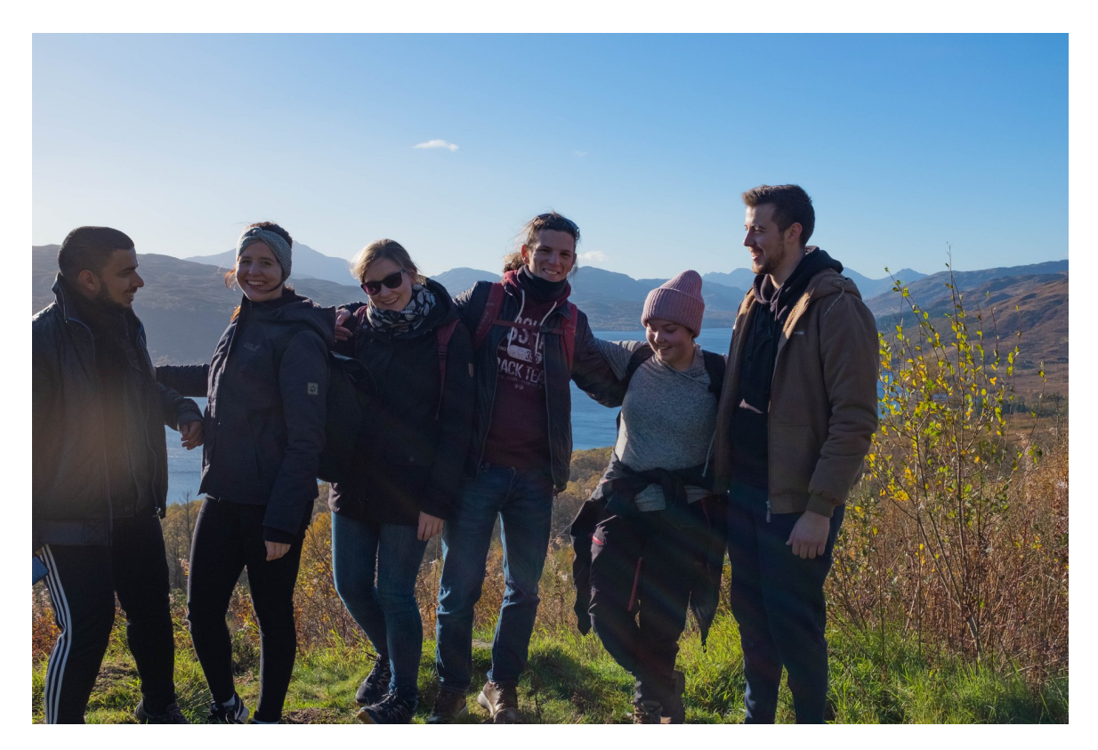
Trip to the Highlands