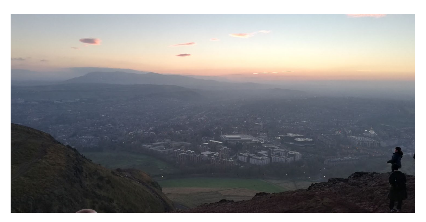
View of Edinburgh from Arthur's seat