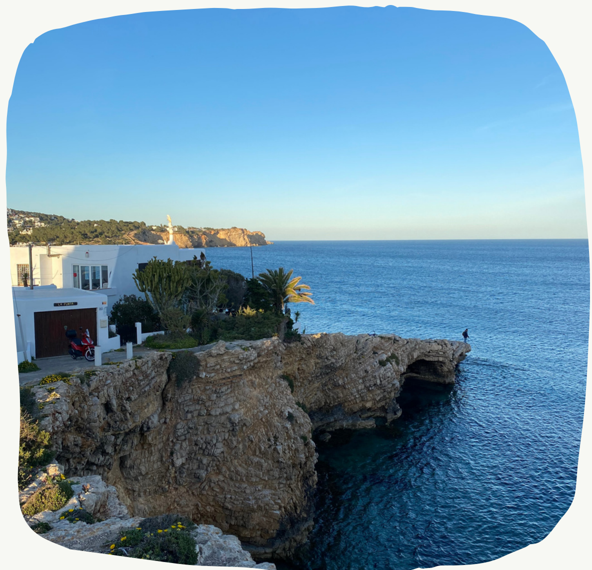
Ibiza trip with friends