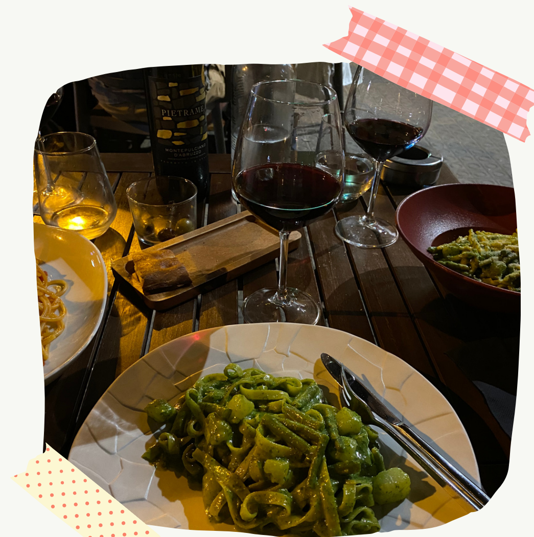
Amazing pasta from Ostaia Cucina Italiana