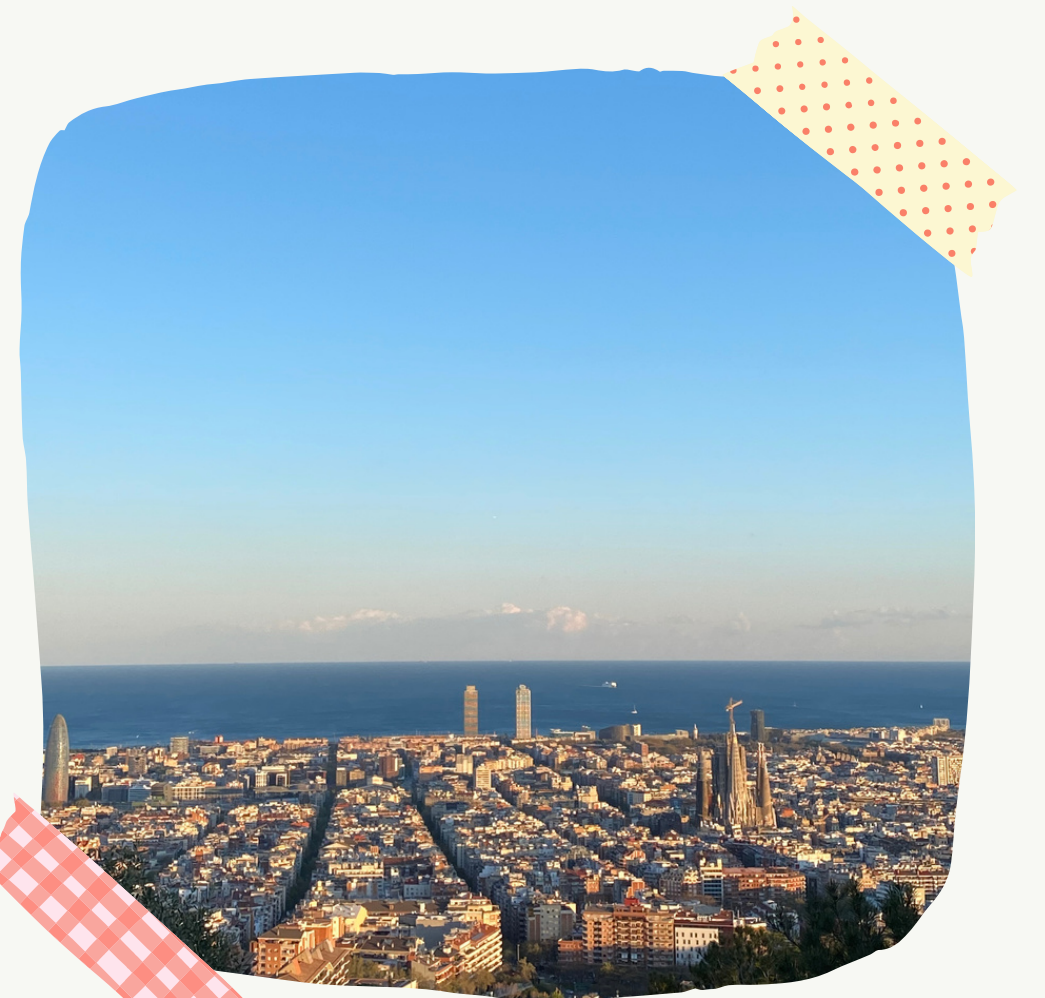
View from the bunkers