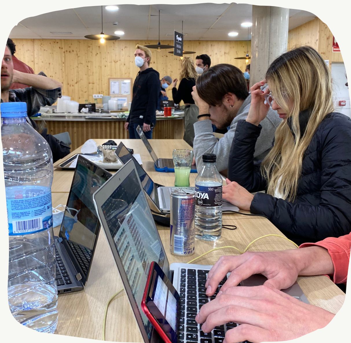
Studying in the cafeteria