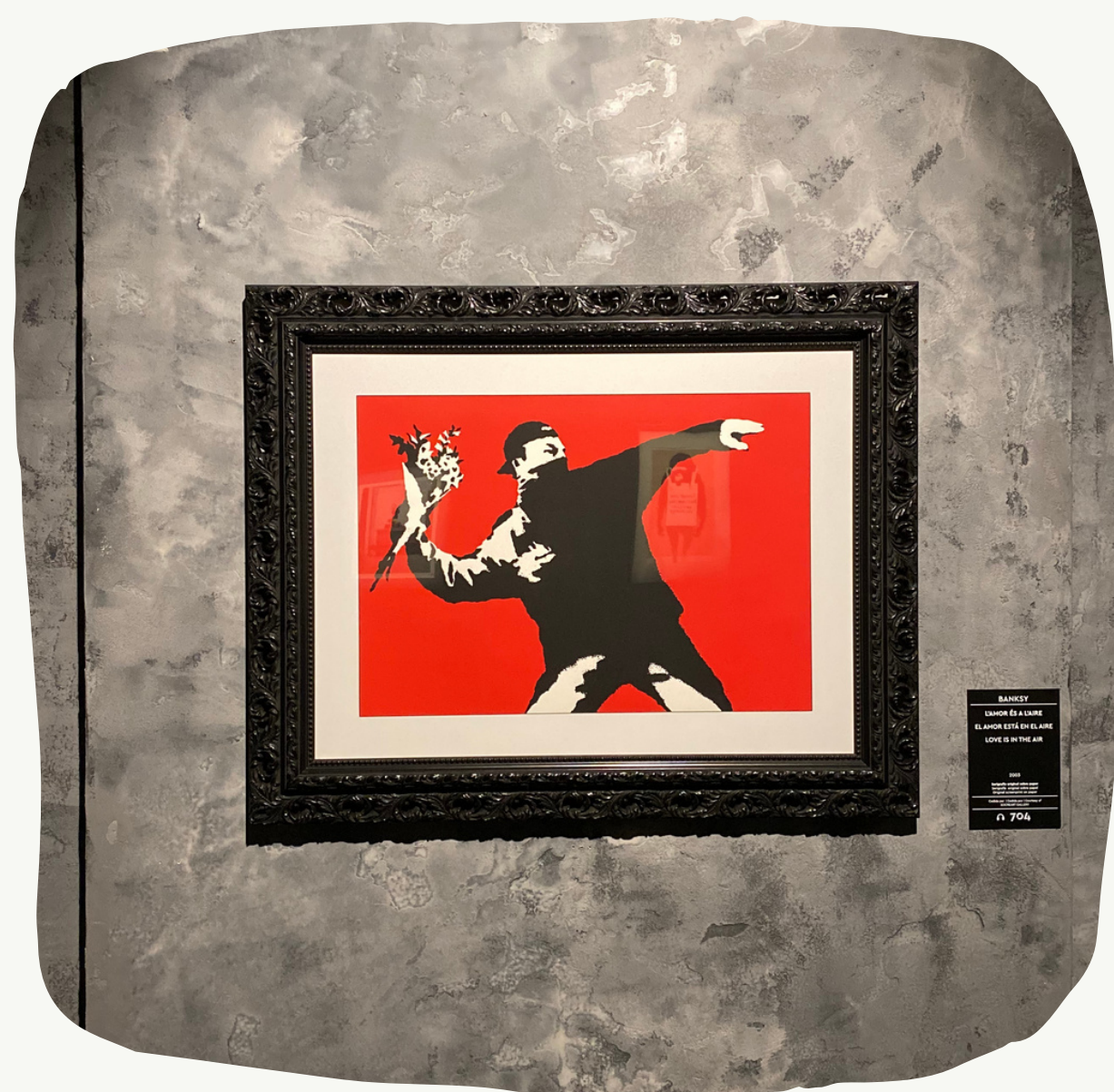
Banksy exhibition with Marketing Services in the Digital Era course

This class is relevant for Multimedia design and for Digital Concept Development. The course is basically a big project where we use design thinking methods to develop our solutions. I felt very confident in this course since it's something I knew already from KEA. I learned some new things and also got another perspective on models or analysis I knew from KEA which was very interesting. In general I like the course, but unfortunately I think the structure of the course was not the best. The thing that didn't really work with this course is that it's kind of like a project on KEA, but it's spread out through the whole semester. We work in groups while the group members have different schedules and other projects at the same time, so it's hard to really get deep into the project and focus. It was a little frustrating because it felt a little chaotic when you know another way to do it. Other than that I think it was a good course. We made a project with SEAT and for the midterm and final exam we had to present in front of representatives from SEAT.