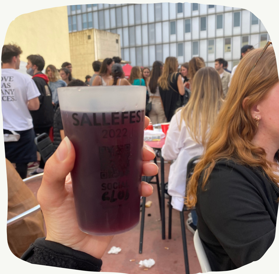
La Salle Fest Week

Advise regarding classes I would say choose the electives over the mandatory classes because at least during my time that's what most international students did and the local students are not very 'motivated' to do much, so my best groups were with the other international students.