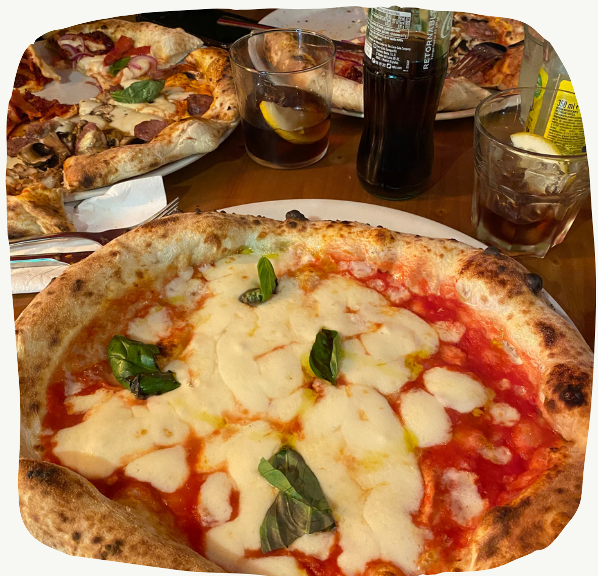
BEST pizza in Barcelona and Ibiza Pizzeria Napolitana Pumarola