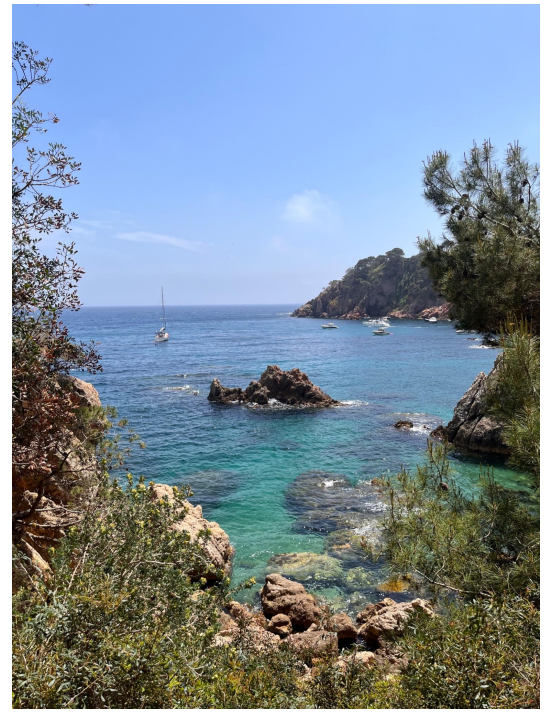
Beach 1,5h from Barcelona in Costa Brava

Being able to live close to a beach. Also I did the exchange together with my close friend from KEA and that made it so much fun. University in Barcelona was a lot more demanding than KEA, with both midterms and final exams in every course, but I loved the challenge and always had enough time to do whatever I wanted.