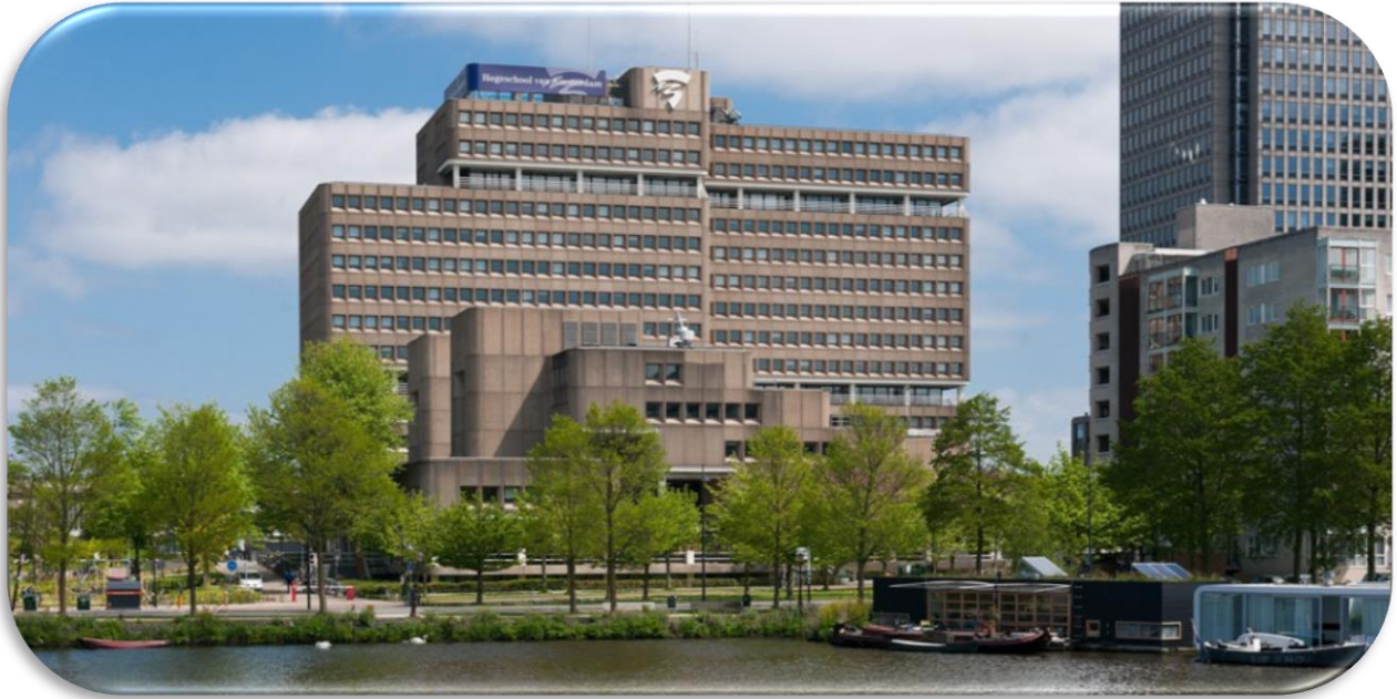
Amsterdam University of applied science

In Amsterdam University of applied science, the way the semester is being organized is kind of different from the way it's been done in Kea. In Kea we have one big project for the whole semester, but in Amsterdam the semester is divided into two blocks, Block 1 and Block 2. In the first block i had 6 subjects and in the second block 7 subjects, some of which were a continuation from the first block. During the first block i had 3 classes a day, which means i had to be in school only two days a week. But that does not mean you have a lot of time doing nothing, because every week we have assignments which we had to present to the teacher the next week. During the presentation of these assignments there is always a good conversation between students and teachers which gives room for advice and recommendations and solutions for problems. During the second block i was in school 3 days a week because the classes increased by one. There is also study trips that have to be done and it is compulsory, the students themselves have to choose 3 cities in the Netherlands to go for excursions.