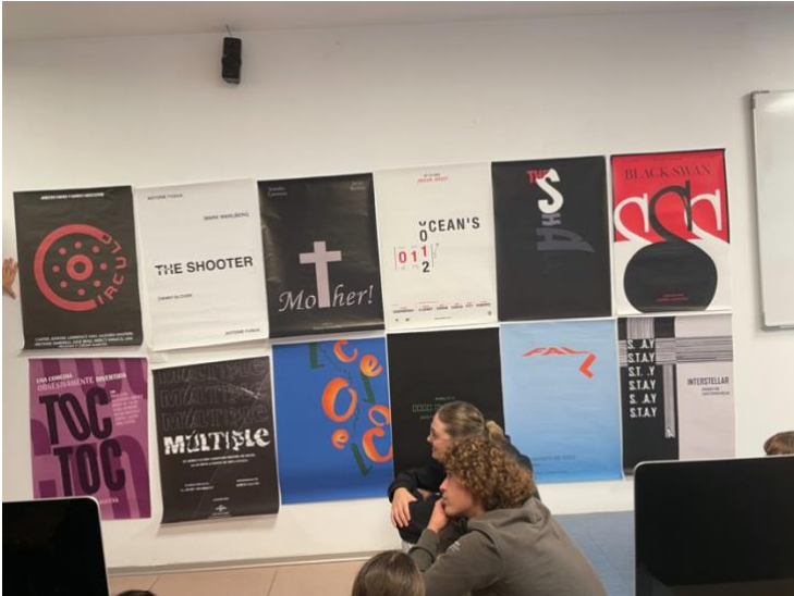
One of our projects for editorial design.

Typography (Tipografía): Learning about the history of typography, different fonts and the simple, but complex anatomy of letters. Did some different assignments where typography was the main focus/element.